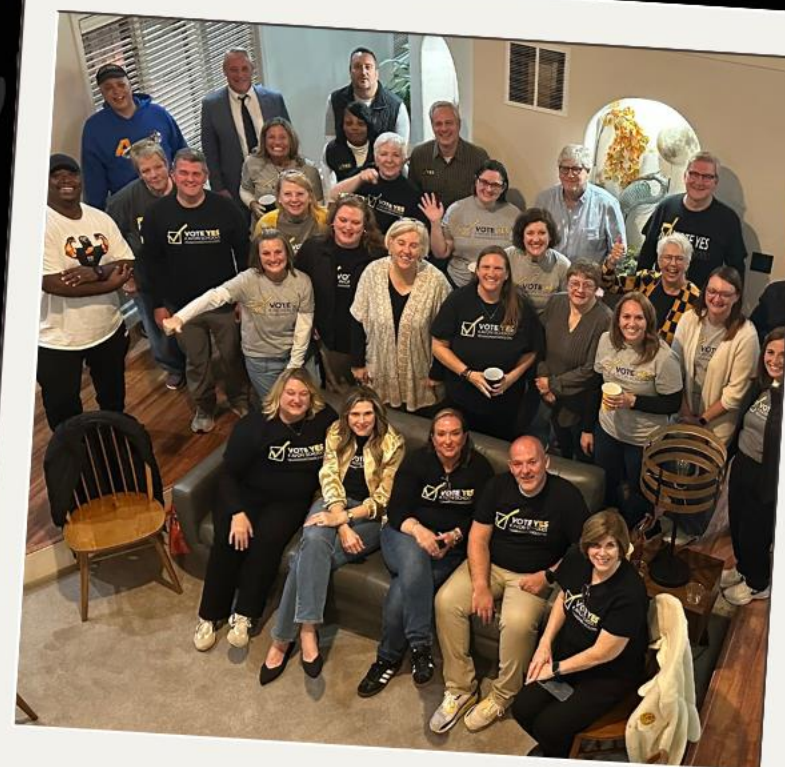
TAXPAYERS 4 AVON SCHOOLS PAC