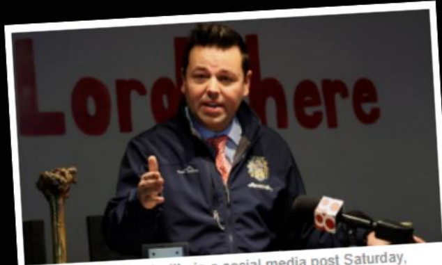
Lt. Gov. Micah Beckwith, in a social media post Saturday, Oct. 25, 2025, wrote "...nothing motivates me more than fighting to protect Hoosier families from ever-increasing property taxes."