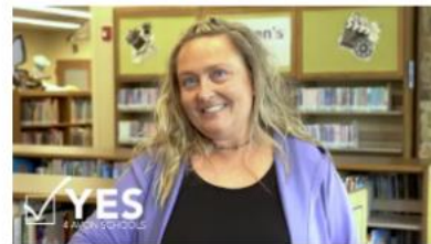
The Library Board Says YES 4 Avon Schools