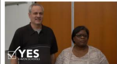
The Oriole Advocates Say YES 4 Avon Schools