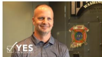
The Washington Township Board Says YES 4 Avon Schools