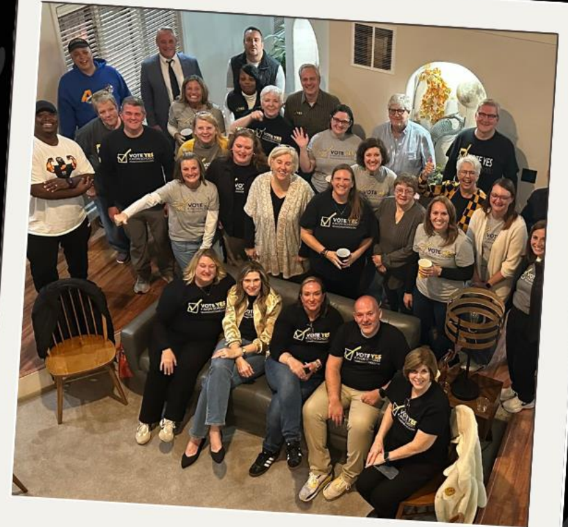
TAXPAYERS 4 AVON SCHOOLS PAC